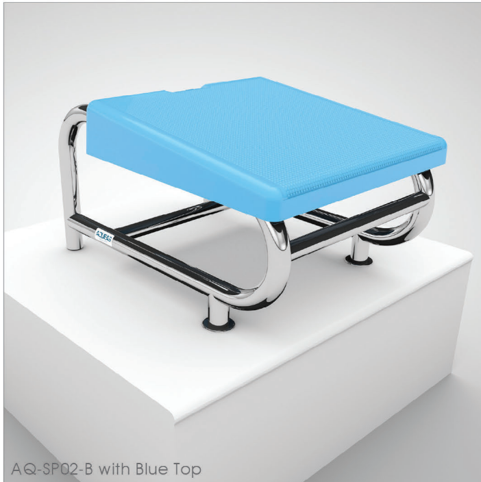
AQ-SP02-B with Blue Top