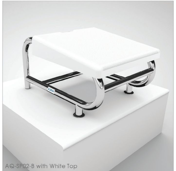
AQ-SP02-B with White Top