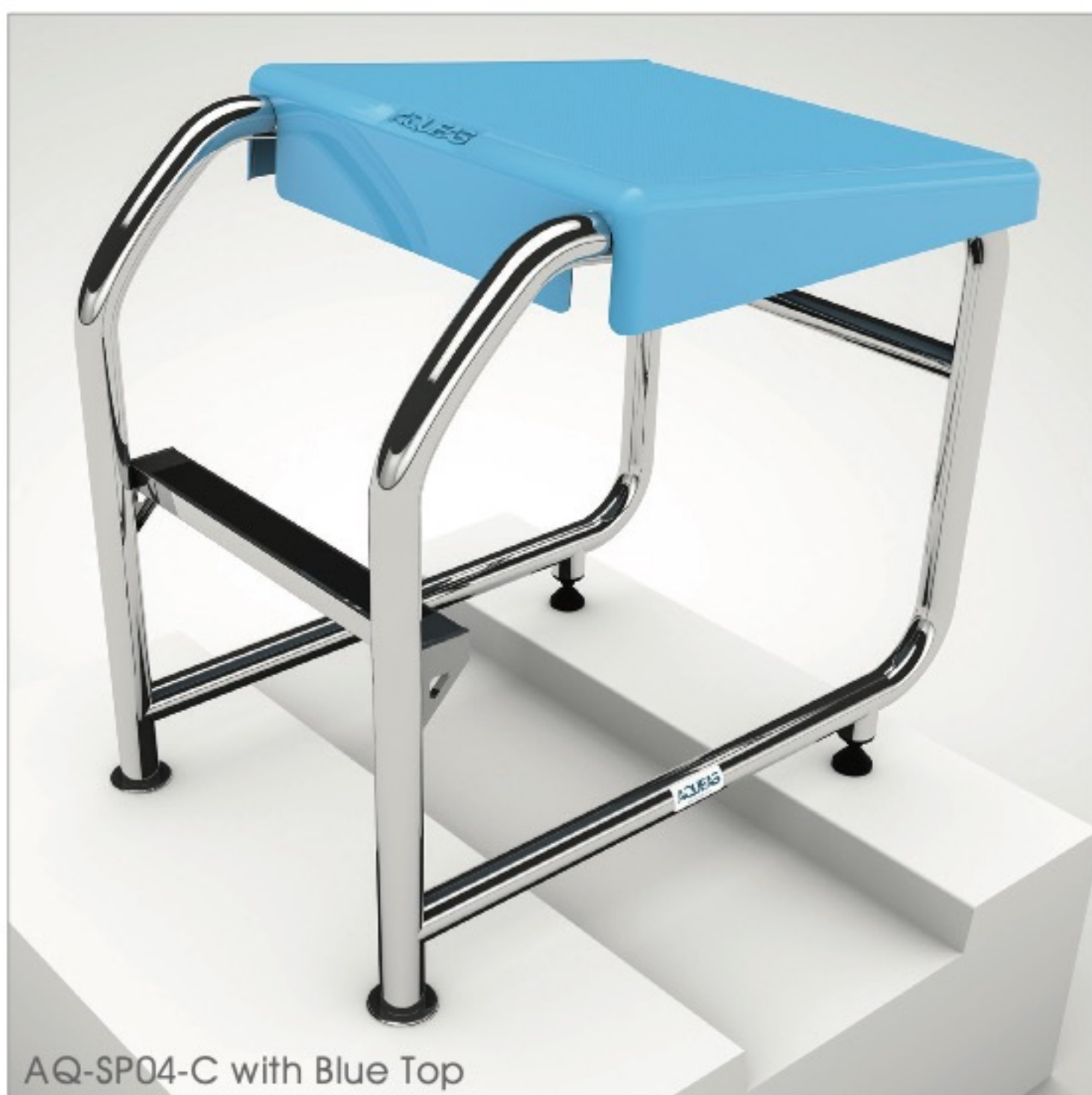
AQ-SP04-C with Blue Top