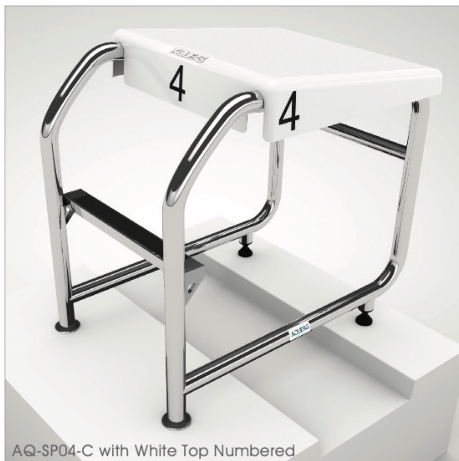
AQ-SP04-C with White Top Numbered