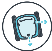
PowerStream mobility system