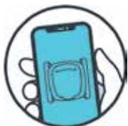
MyDolphin™ Plus wifi connectivity