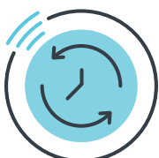
Cycle time selector