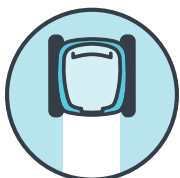
Dual active scrubber