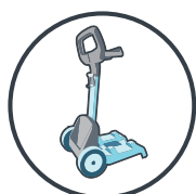
Caddy for storage and handling