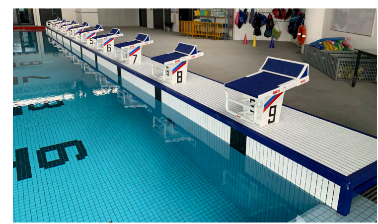
FINA Competition facility, SuperBlock 750