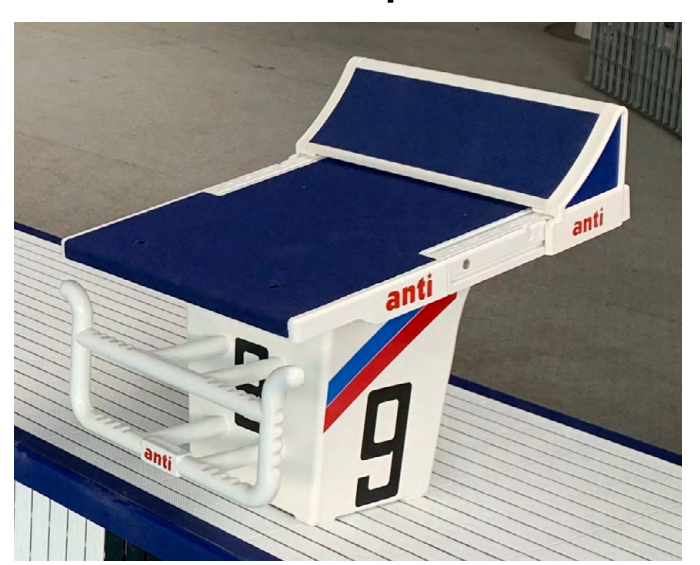
SuperBlock 750 with 5 Point Moveable Track Start System