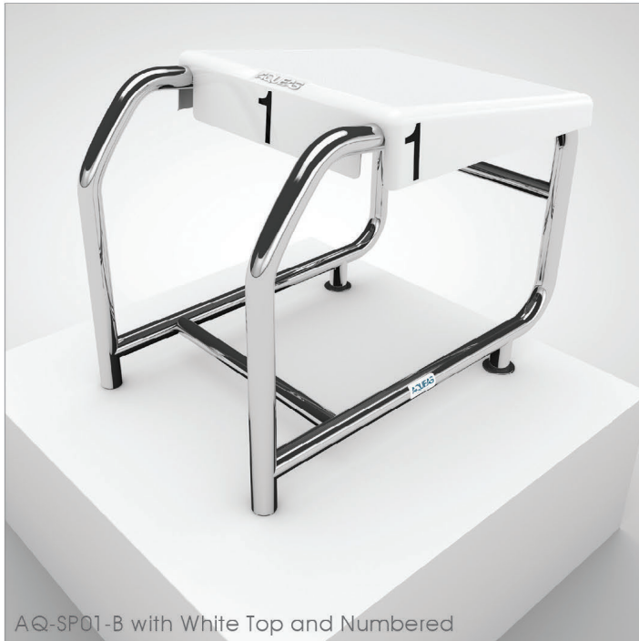
AQ-SP01-B with White Top and Numbered