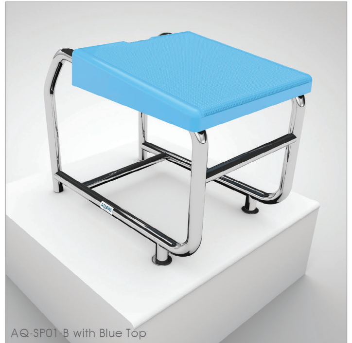
AQ-SP01-B with Blue Top